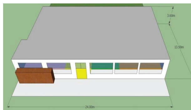
Figure 1. Gross anatomy dissection study room.